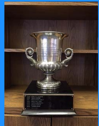
Cup of Kindness to be awarded June 7